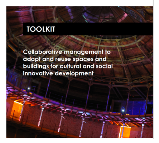
Fig. 2 The toolkit is the synthesis of Activity 1 (Analysis of existing present practices and local regulations) and Activity 2 (Proposal of a model -operational scheme- to foster collaborative management as systematic methods) defined in the Action Plan of the Culture & Cultural Heritage Partnership.

Urban Agenda for EU Partnership on Culture & Cultural Heritage